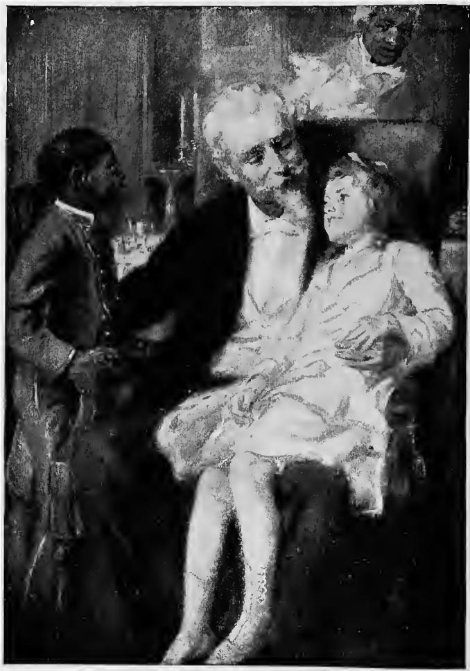
Katy dropped her head on his shoulder again.